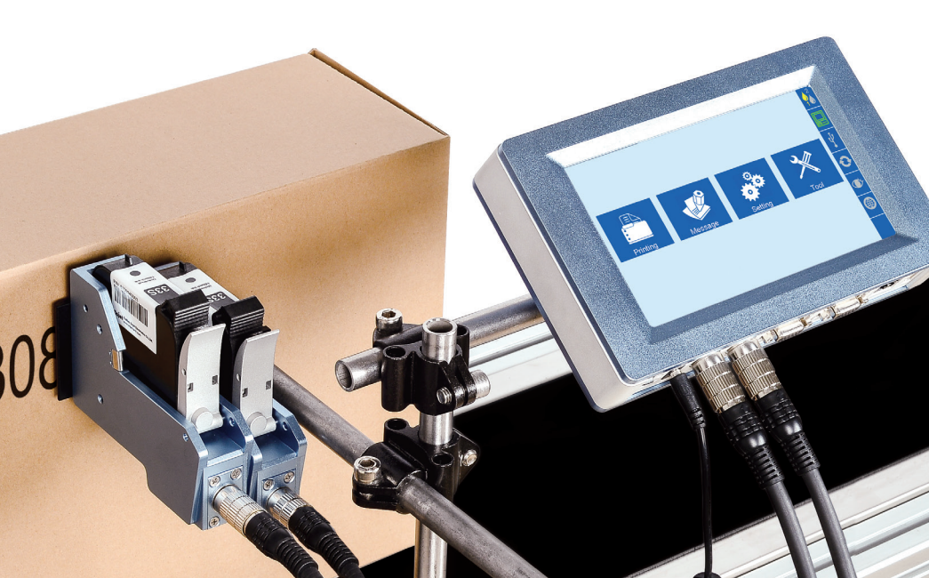
Elfin II Double Heads Inkjet Printer