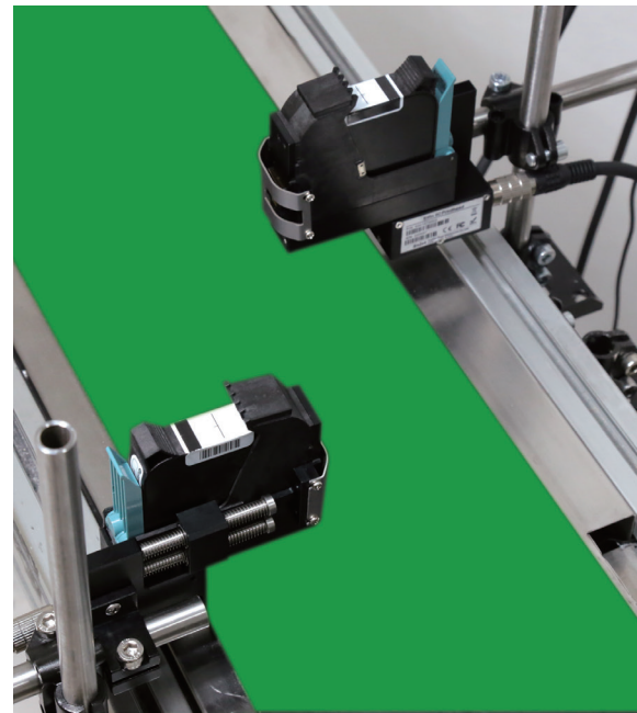
Elfin IIC Uneven Surface Inkjet Printer