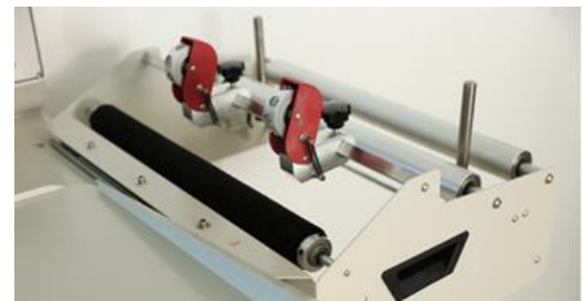
Improved needle wheel