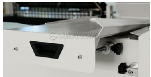
Board for separating film.