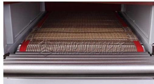
Teflon conveyor belt